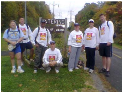
(First group in front of "Entering Vienna" sign)

The majority of the project was done on-line by a handful of people. An anonymous donor from the Gainesville-Haymarket Rotary Club of Virginia opened the door by providing the capital to setup the on-line registration and donation site ( www.firstgiving.com/rotarywalk ). We kept Rotary Walk simple and made it easy to sign-up and donate. Clubs in Virginia, Maryland, and Washington, D.C. signed up. By October 24 th , there were 15 teams registered, including one in Costa Rica. And we reached our initial fundraising goal of $8,000 for Polio Plus. All that was left to do was the walking.