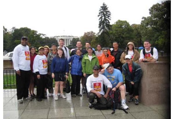
(The group in front of the White House)

It all started a few months ago when we began challenging Rotarians across America and around the world to walk for any distance or length of time on October 24 th , World Polio Awareness Day, to raise money for Polio Plus.